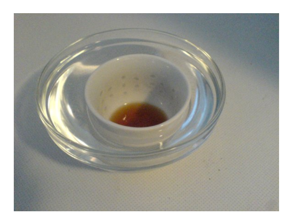
Figure 1: Heat a cup with linseed oil in a bain-marie.

8 After the last impregnation and drying, remove all excess oil with a piece of toilet paper and store the wooden weapon in the weapon bag.