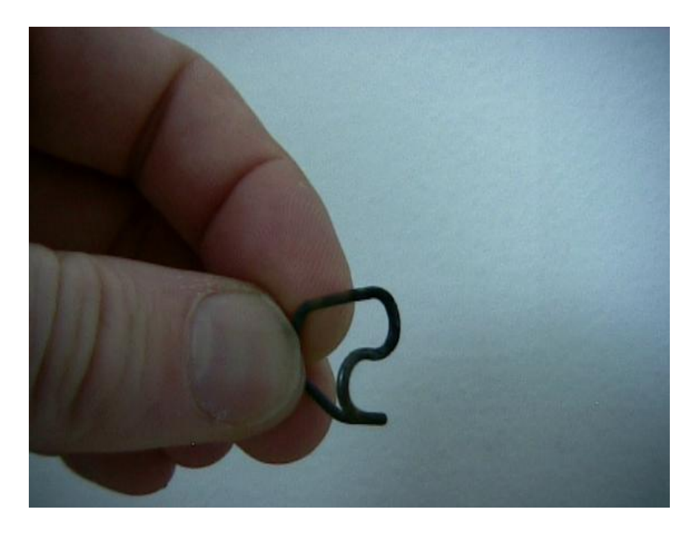
Figure 8: Example brandmark for character 'S' seen from below in mirror view.