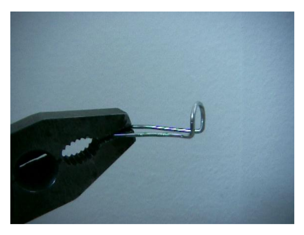
Figure 6: Make sure the resulting brandmark template can be held by a pair of pliers.