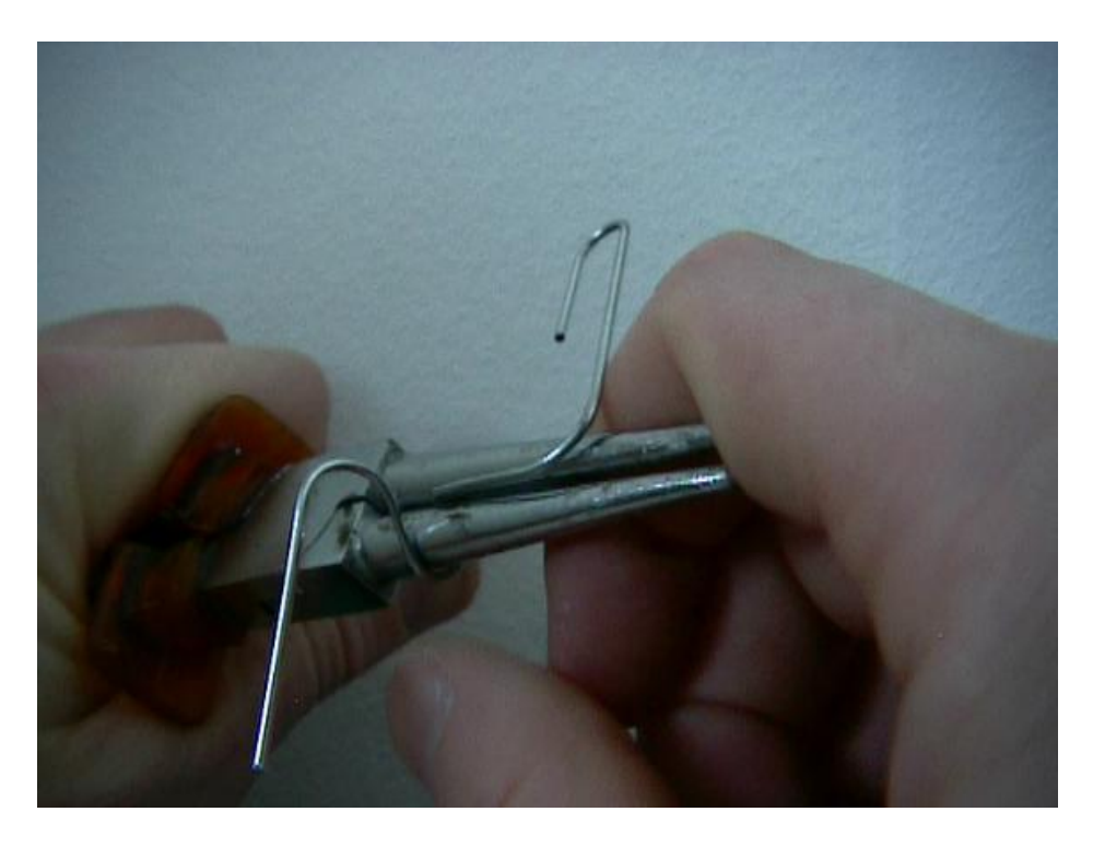
Figure 5: Fold the paperclip into a personal brandmark, try to be as unique and creative as possible.