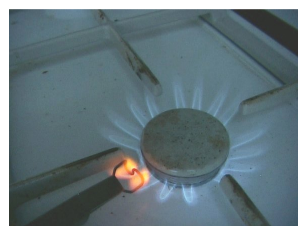
Figure 9: Heat the brandmark template while holding it with a pair of pliers until it is red hot.