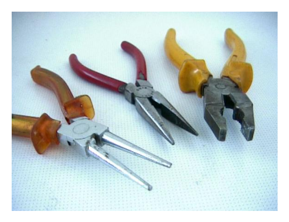
Figure 3: Tools which are needed.

and from rapid climate changes which might bend or split the wood. In most countries it is also required by law to transport your wooden weapons in a closed weapon bag. To prevent the wood from drying out, you can, during a training, moisturise it by applying its own sweat to the wood.