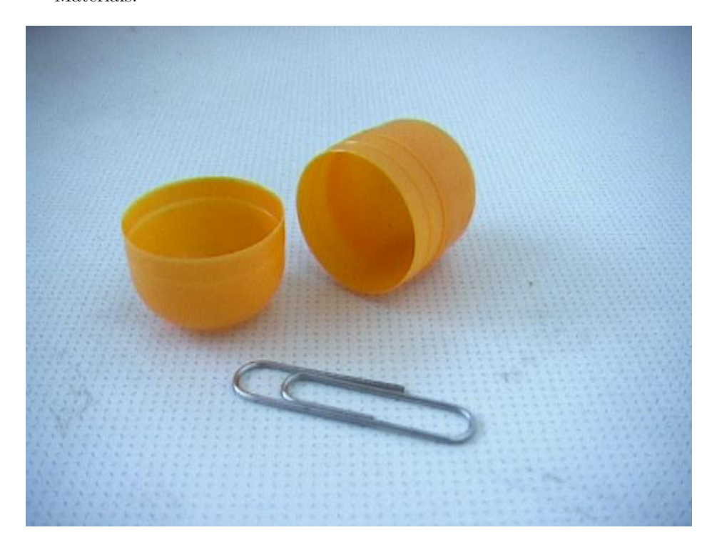
Figure 2: Materials which are needed.